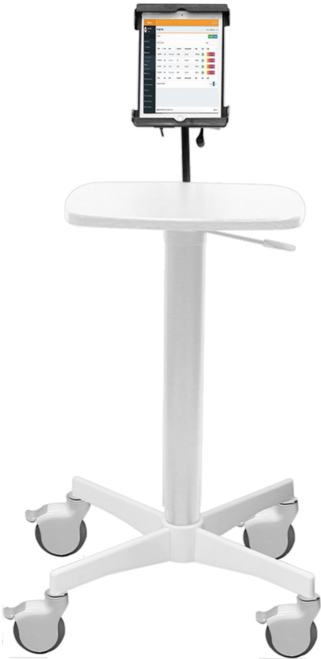
Wound Care Cart